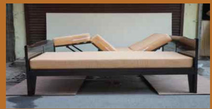
Motorised ICU bed wooden panelling