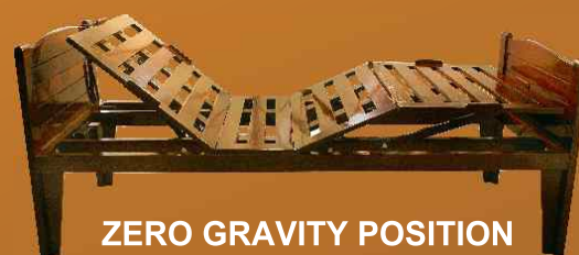
ZERO GRAVITY POSITION