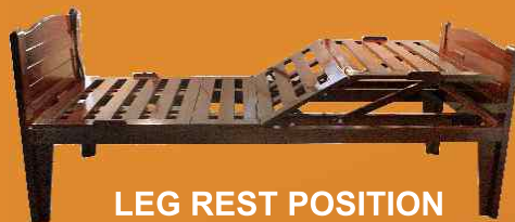
LEG REST POSITION