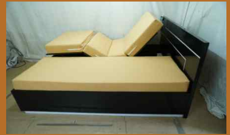
Double Bed Teak wood